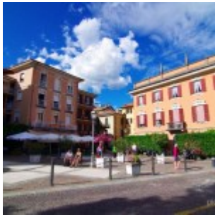
Menaggio Plaza along the Lake