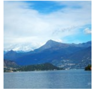
Lake Como Italy