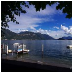
Lake Como Italy view from Menaggio