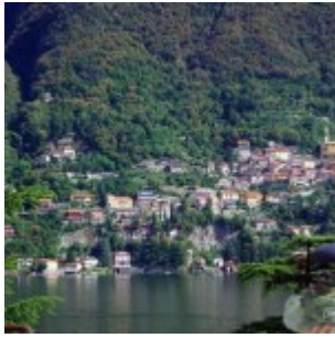
Village along Lake Como Italy