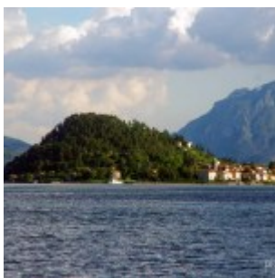
View to Bellagio Italy