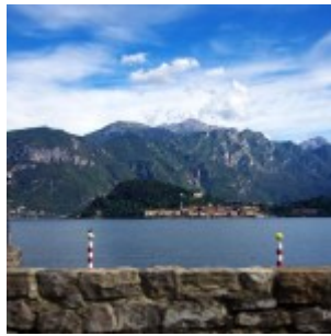
Bellagio Lake Como Italy