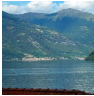
Lake Como Italy