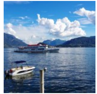
Ferry on Lake Como, Italy