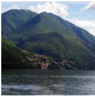
Village along Lake Como Italy