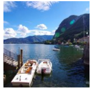
Boat Rental at Lake Como Menaggio