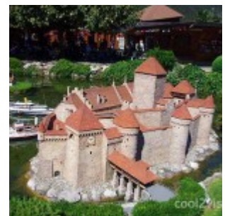
Swissminiatur Chillon Castle