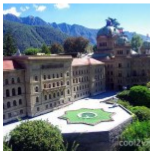
Swissminiatur Bundeshaus Bern