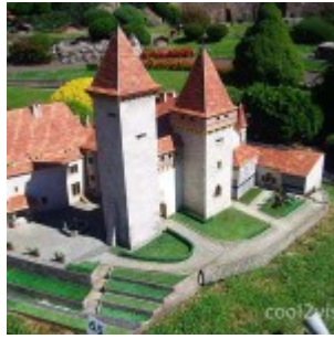
Swissminiatur mountain resort