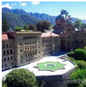
Swissminiatur Bundeshaus Bern