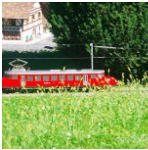
Swissminiatur red arrow train