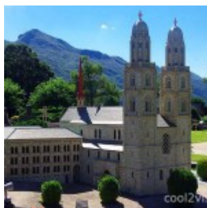
Swissminiatur Grossmuenster Zurich