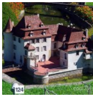
Swissminiatur Bottmingen Castle

See the attached images for just a few impressions from Swissminiatur.