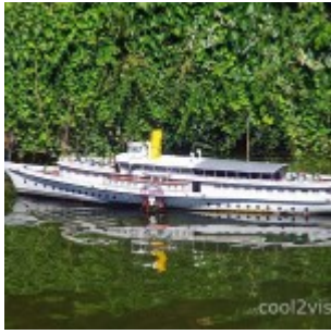
Swissminiatur Lake Boat