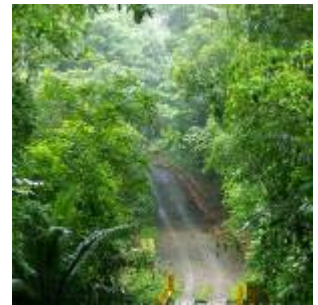
Pipeline Road Soberania National Park Panama