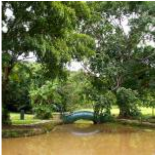
Summit Garden Zoo, Panama