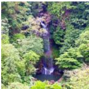
la Tavida Watterfall, Panama