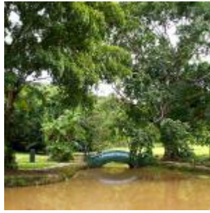
Summit Garden Zoo, Panama