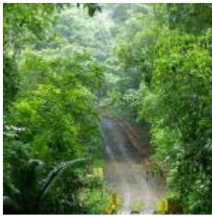
Pipeline Road Soberania National Park Panama