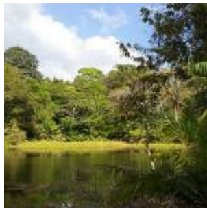
Lake at the rainforest discovery center