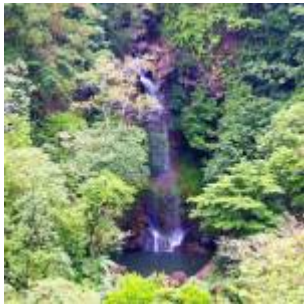
la Tavida Watterfall, Panama