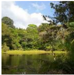
Lake at the rainforest discovery center