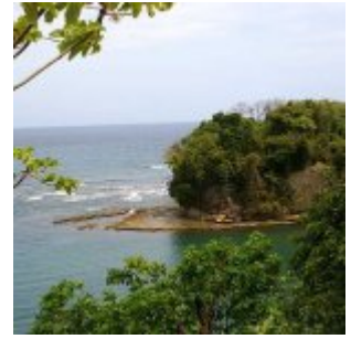
San Lorenzo Colon