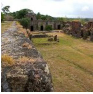
Fort San Lorenzo Colon