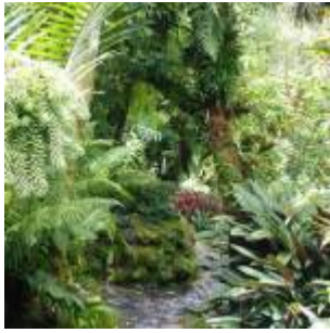
Cerro Punta is the Dracula Orchid Farm