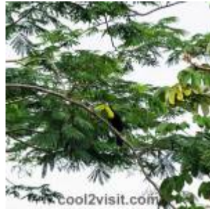
Toucan in Panama