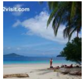
Isla Granito de Oro