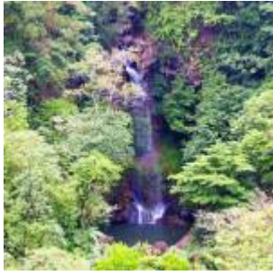
la Tavida Watterfall, Panama