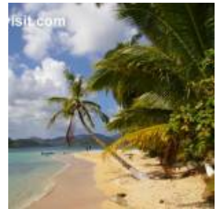
Isla Grande Panama