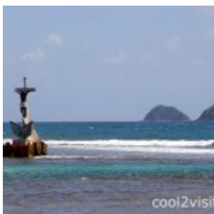
Isla Grande Panama