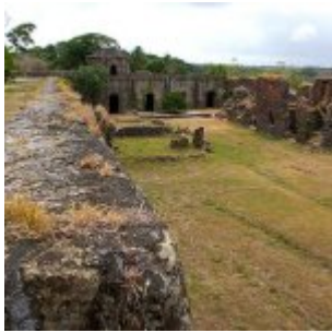
Fort San Lorenzo Colon