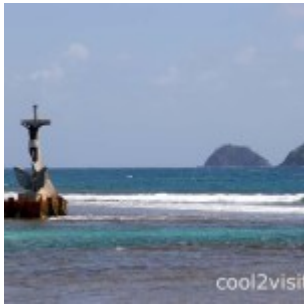
Isla Grande Panama