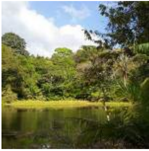
Lake at the rainforest discovery center