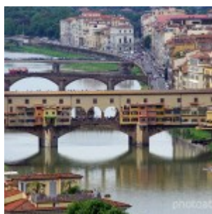
Ponte Vecchio - Arno River