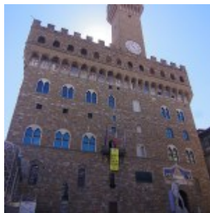
Palazzo della Signori