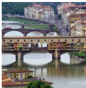
Ponte Vecchio - Arno River