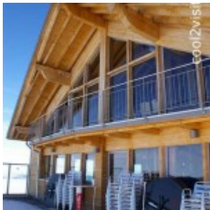
restaurant on the summit of the Fronalpstock at 1922 m above sea level