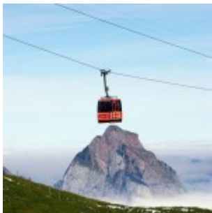
cable car from Stoss up to the Fronalpstock