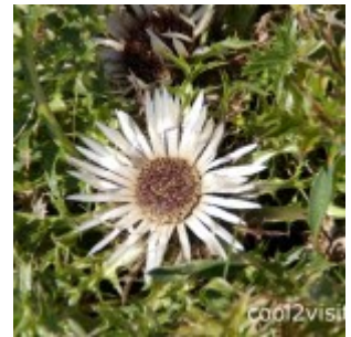
Flower on the alp