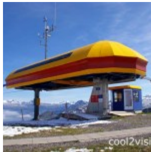
Ski lift on the summit of the Fronalpstock