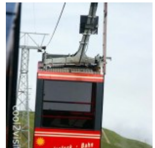
cable car from Stoss up to the Fronalpstock