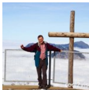
Our visit to Fronalpstock back in 2008