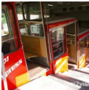
Funicular from the base station (bus stop or parking) to Stoss, Switzerland

Attached are a few images taken back in 2008 in the month of September.