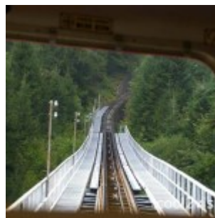
Funicular from the base station (bus stop or parking) to Stoss, Switzerland