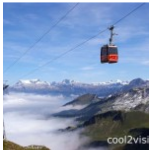
cable car from Stoss up to the Fronalpstock