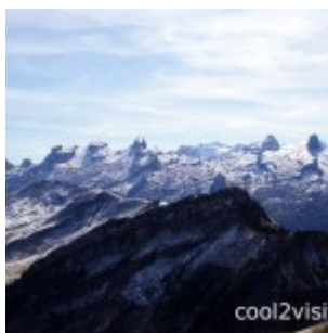
Swiss Alps Panorama View