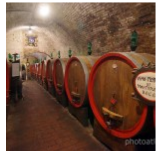
Wine Cellar in Montepulciano