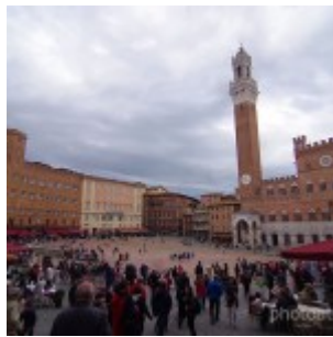
Piazza del Campo, Siena