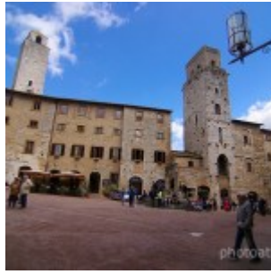
San Gimignano, Tuscany