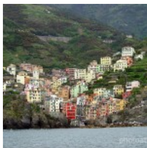
Riomaggiore Cinque Terre