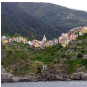
Cinque Terre Liguria