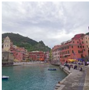
Manarola Cinque Terre