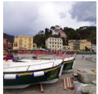
Monterosso Cinque Terre