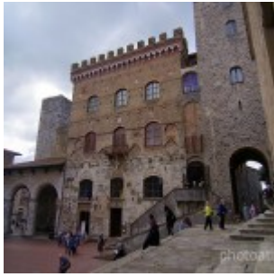
San Gimignano, Tuscany