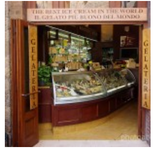
Gelateria Tuscany Italy