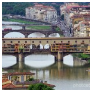
Ponte Vecchio - Arno River