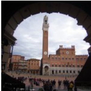
Piazza del Campo, Siena