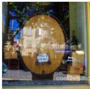
Fine French Wine and Souvenirs