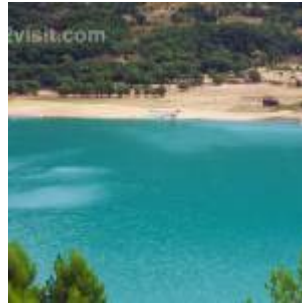
Lake of Sainte-Croix boat rentals