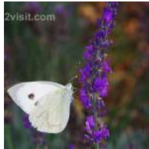
lavender flower and butterfly