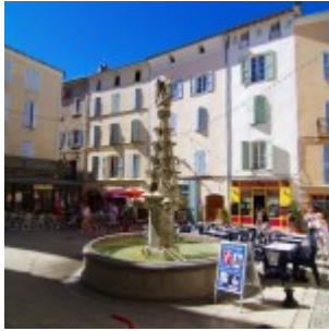
Forcalquier Village Plaza