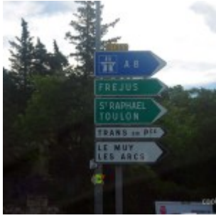
French Road Signs