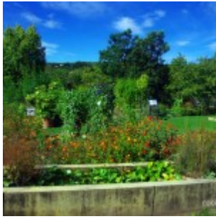
Salagon, France, botanical gardens