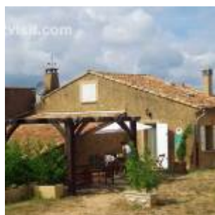
Gites de France

The attached images were taken in the general area of Verdon Gorge and Lake of Sainte-Croix.