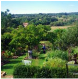
Salagon ethnobotanical gardens