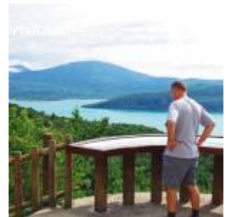
Lake of Sainte-Croix