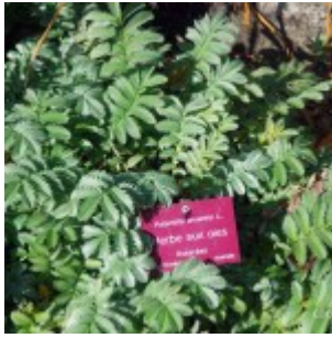
Jardins de Salagon -Garden Herbs