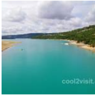
Lake of Sainte-Croix, France