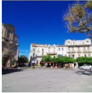
Forcalquier Village Plaza