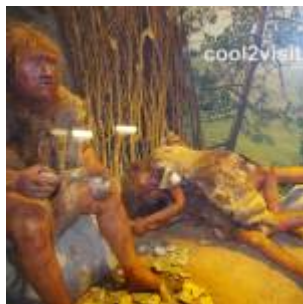
Musee de Prehistoire de Gorges du Verdon