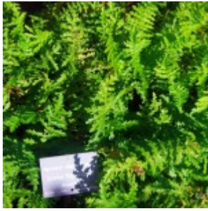
Jardins de Salagon -Garden Herbs