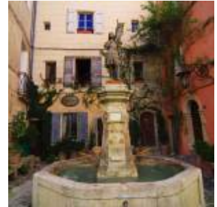
Joan of Arc Fontaine