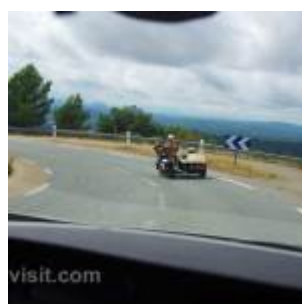
Winding Roads around the