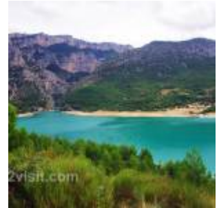
Lake of Sainte-Croix