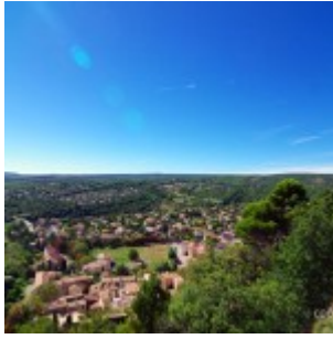
View from Forcalquier