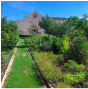
Salagon, France, botanical gardens