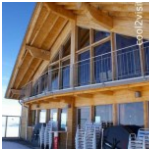
restaurant on the summit of the Fronalpstock at 1922 m above sea level