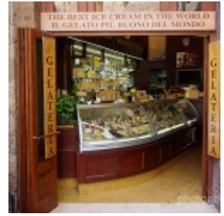
Gelateria Tuscany Italy