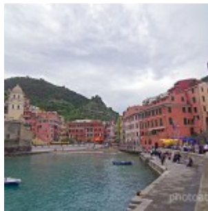
Manarola Cinque Terre