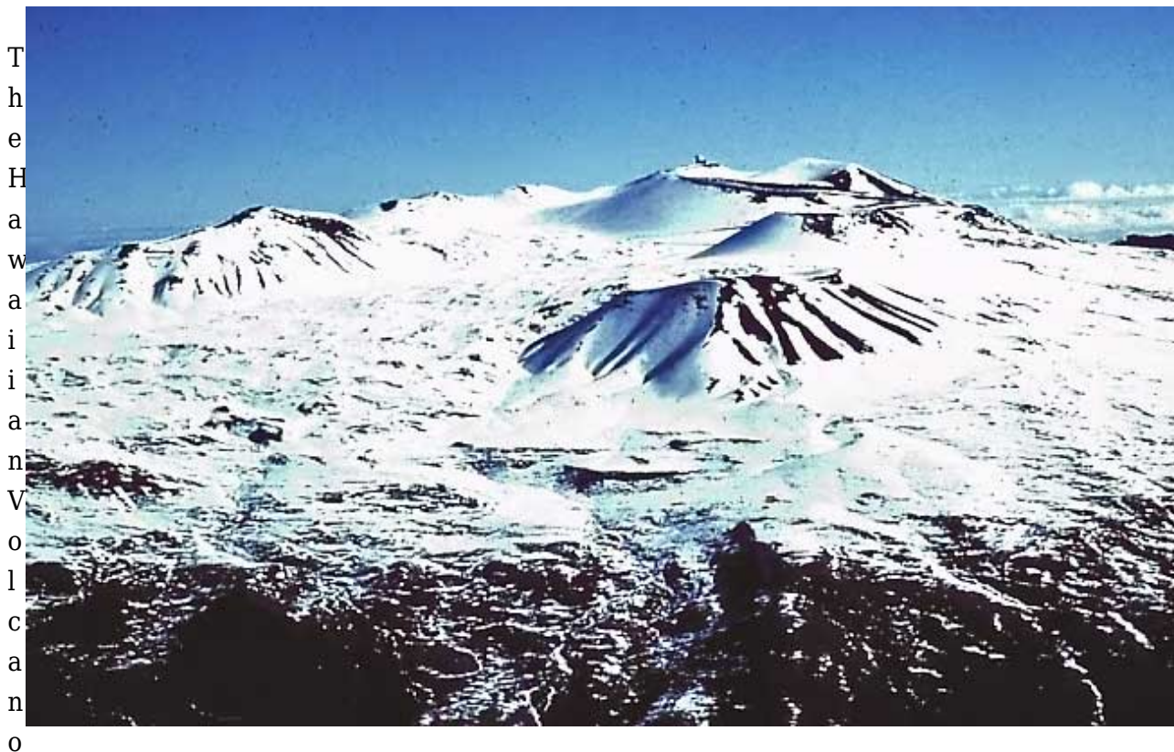
Mauna Kea also called the White Mountain

But then you reach the top of Paradise and ski or snowboard towards the deep blue Pacific, this will be an unforgettable adventure not many undertake so why wait get there and get going. And of course in the afternoon ready for surfing the big waves and having a good time on the sunny beach! Now can life get any better? Well you tell me! See also this Hawaii Info Guide page here for some more details and contact info and for other top destinations please see our frontage at cool2visit.com .